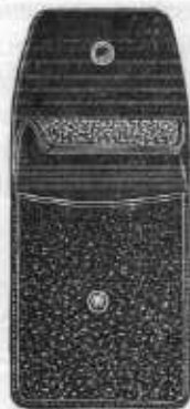
Coin side of Purse.

The Most Appropriate and Convenient Purse on the Market to accommodate the new PAPER MONEY as well as COIN.